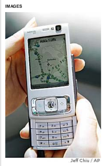
View Larger Image

(11-09) 18:27 PST -- Cell phones are often derided for distracting drivers, causing accidents or slowing traffic. But beginning Monday, cell phones could help speed traffic - or at least give drivers a better idea of how long it will take to get where they're going.